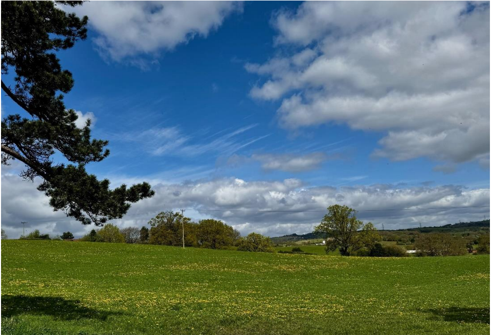
A host of golden dandelions - looking towards Waseley (14 th April 2024)

Fairfield Village Community Association, a group of residents working hard for Fairfield, Wildmoor & Stoneybridge.