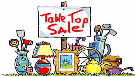
Table Top Sale & Freecycle Corner: 16 th March

On the opposite page, see advert promoting the event. During the event, the Forfeld Café will be open.