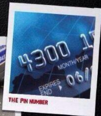
THE PIN NUMBER