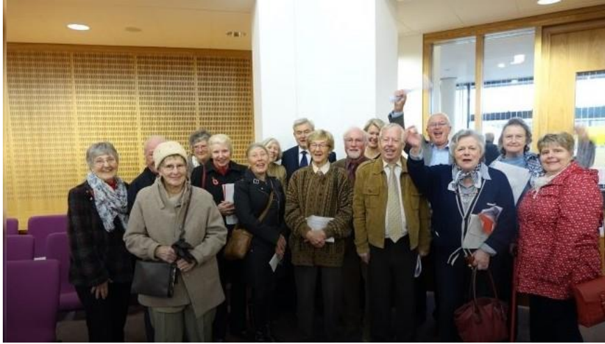
Jubilant residents after hearing the Council's unanimous decision

The planning application for the construction and operation of an Incinerator Bottom Ash (IBA) Recycling Facility accepting 120,000 tonnes per annum along with ancillary/welfare facilities and operation of mobile equipment on site was unanimously refused by the County Council Planning Committee on the 1st November 2016.